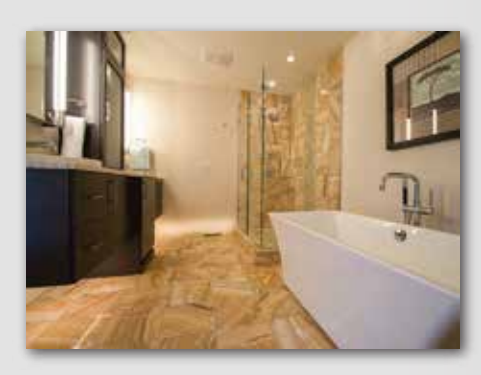
Master Bath With Designer Fixtures