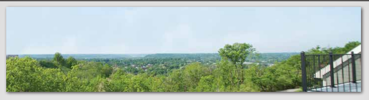
Breathtaking River Valley Views Span From Lunken In The East To Downtown Cincinnati In The West