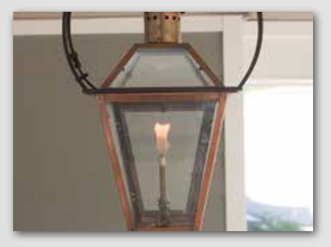
Gas Lanterns And Streetlamps