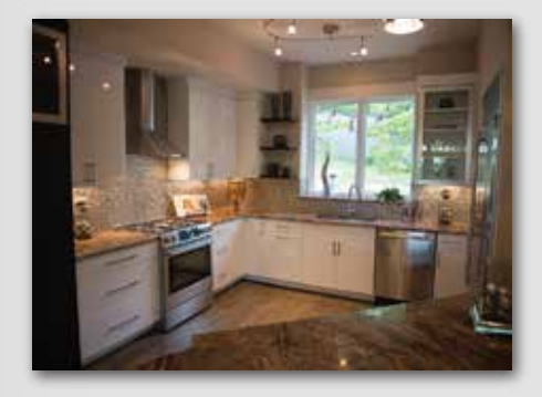
Custom Kitchen, Ultra High-End Appliances